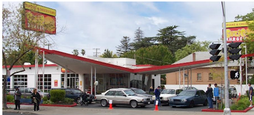
(More 2011 Event Photos: http://www.sacvolvoclub.org/Home/events/2011-past-events#M4a )